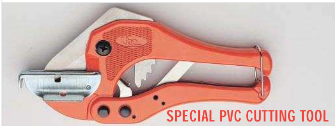
SPECIAL PVC CUTTING TOOL