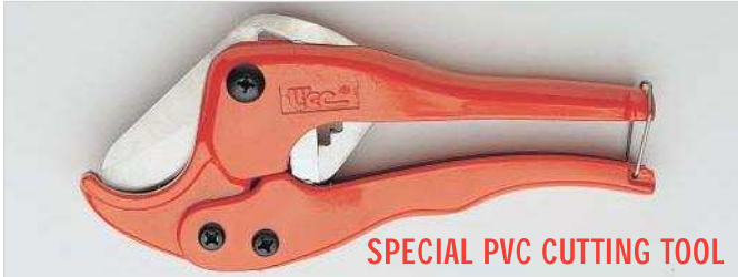
SPECIAL PVC CUTTING TOOL